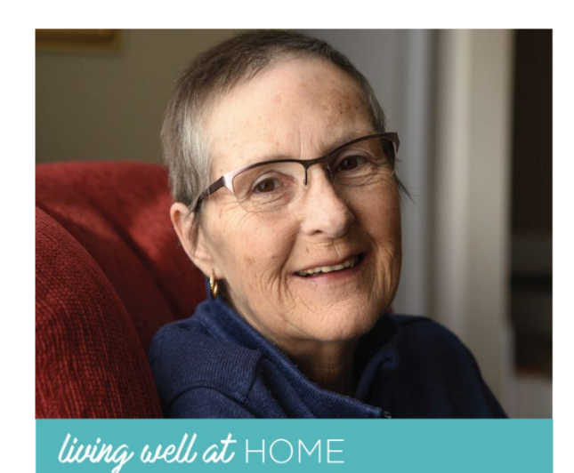
Support for people throughout their illness, improving quality of life and well-being.