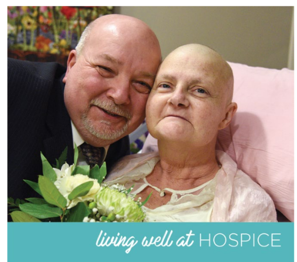
Care, compassion and dignity for people at end of life and their families.