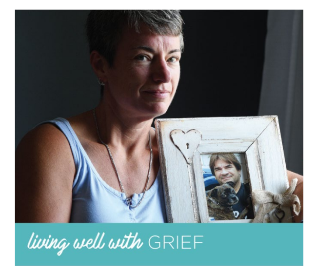
Children, youth and adults explore feelings of grief and loss, in a safe and supportive space.