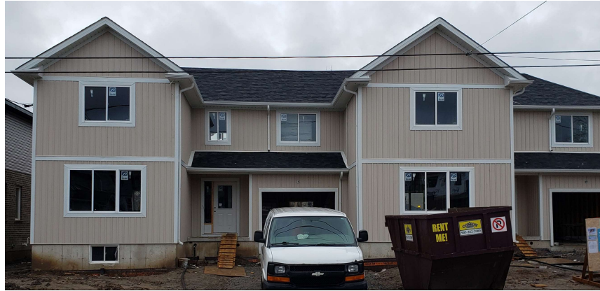
Taylor Street, Thorold