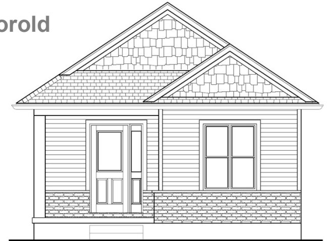
Mitchell Street, Port Colborne