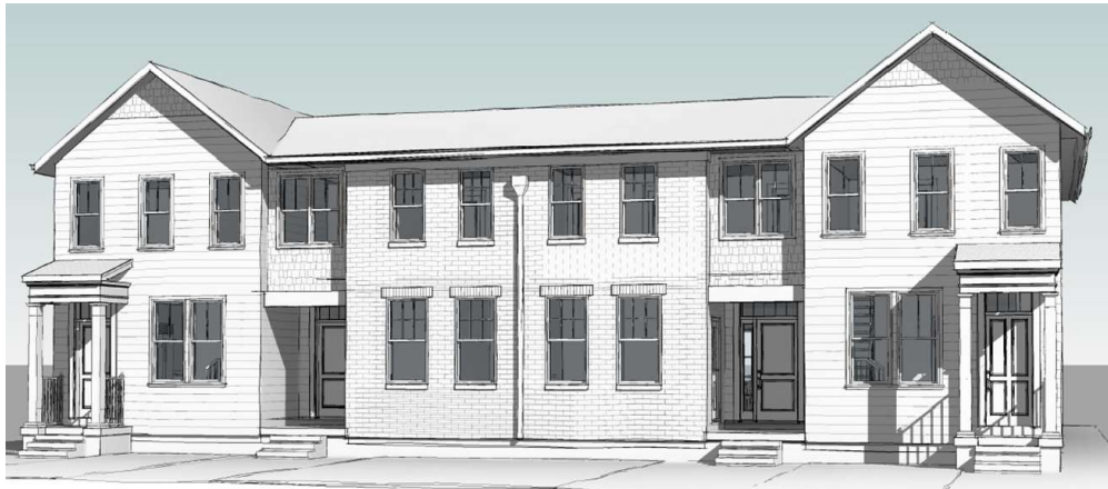
Mary Street, Thorold