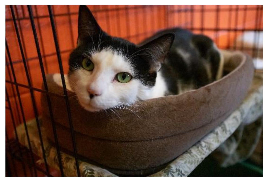
"Walter" at the PC shelter in front lobby area

It is our hope that implementation of this operating model can take effect in May 2025 before the busy spring/summer season