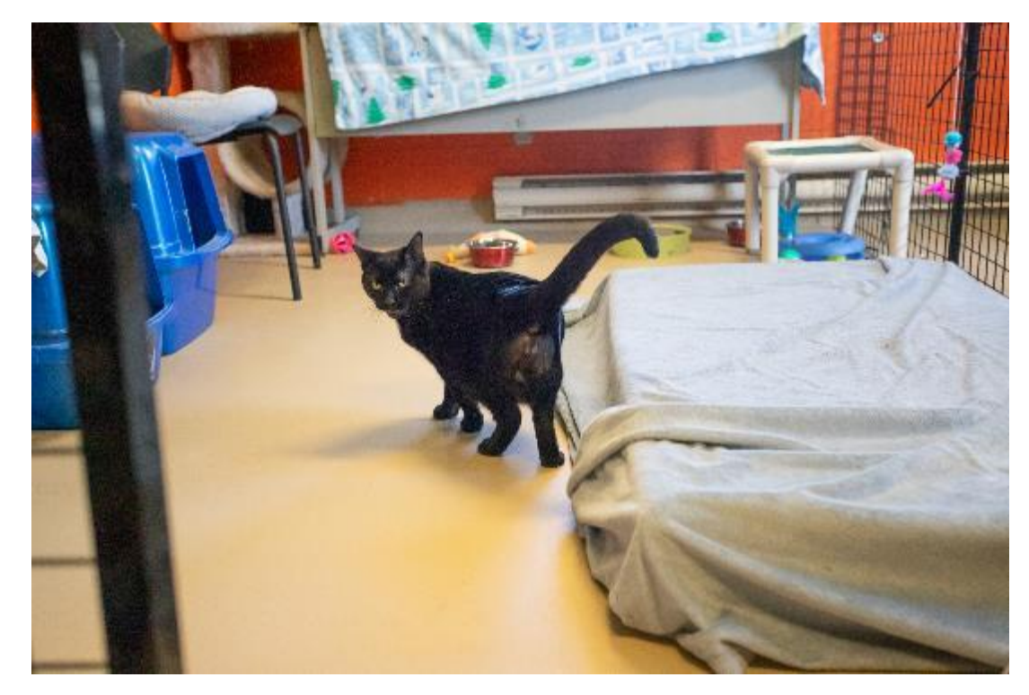
Cat in PC shelter community cat room