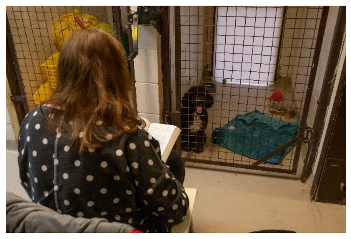
Volunteer reading to dogs in the PC shelter kennels