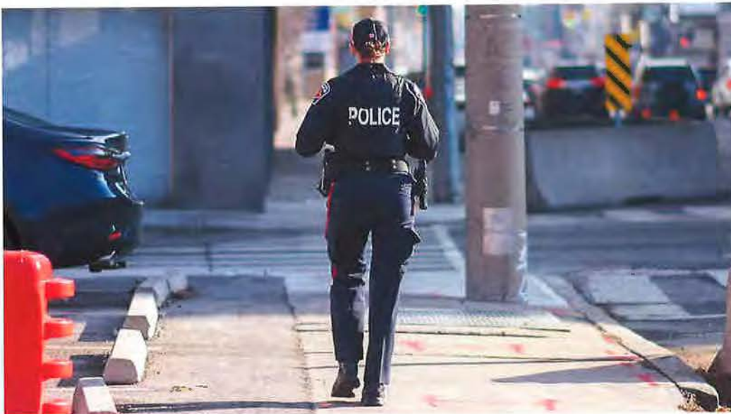
A file photo of a police officer walking in downtown Hamilton, Ont.

The Ontario government is reminding municipal leaders that they cannot use their provincially granted "strong mayor powers" to challenge or limit police budgets.