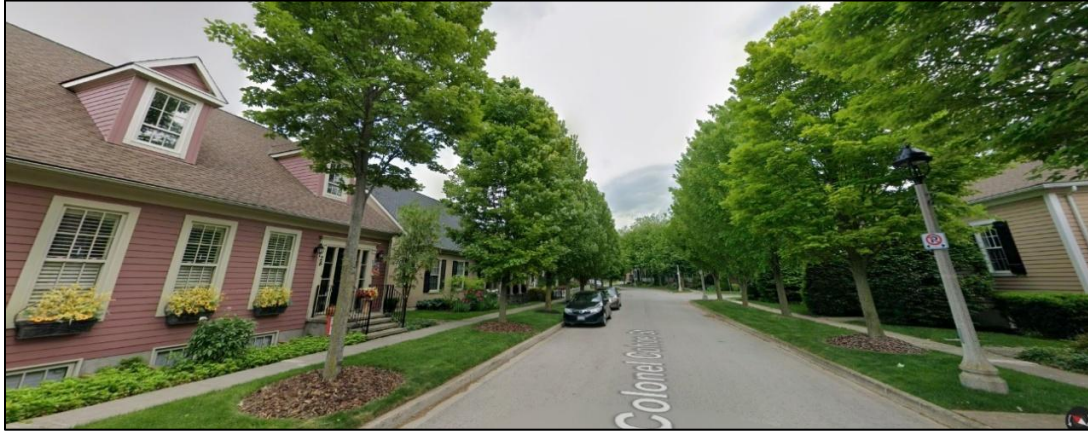
Figure 2: A modern 7.5 m wide (TND) carriageway helps calm traffic speeds (The Village, NOTL, ON)

With that background, the proposed modifications include: