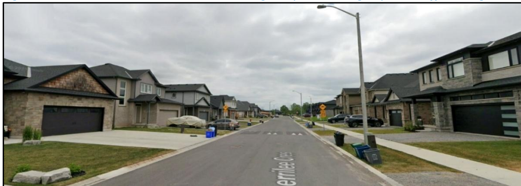
Figure 1: A modern 8.5 m wide (CSD) carriageway invites high speed traffic (Niagara Falls, ON)

The problem with CSD residential streets is that they've become infamously associated with residential speeding issues, higher rates of collisions, reduced landscaping and legitimate safety concerns. The modern residential CSD street widths we're most familiar with became popularised around the mid-1900s during the widespread adoption of the automobile. Routinely defended on the basis of snow plow & garbage truck operational convenience and, (despite the opposite being true), 'safer' for traffic due to wider, more forgiving design geometrics. 1