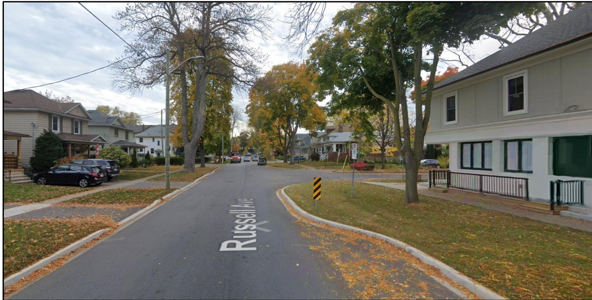
Figure 3: New curb extensions on Russell Av, St. Catharines

Several curb extensions are proposed to enhance the safe streets design program. Curb extensions (aka bulb-outs) (Figure 3) are an effective traffic calming measure and one that is recognised by Port Colborne's own Traffic Calming Policy . Despite their popularity and success across Niagara, Ontario, and beyond, their inclusion is less vital to the neighbourhood's overall success relative to the proposed carriageway width and corner radii.