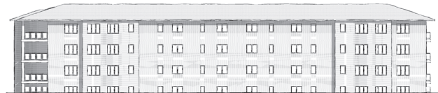
4 RIGHT EAST ELEVATION 3/64" = 1'-0"

LOT AREA = 1839.48 m 2 = 100% EXISTING BUILDING COVERAGE = 210.61 m 2 = 11.45 % (TO BE REMOVED) EXISTING DRIVEWAY COVERAGE = 1482.46 m 2 = 80.60 % (TO BE ALTERED) LANDSCAPE COVERAGE = 146.41 m 2 = 7.96 % (TO BE ALTERED)