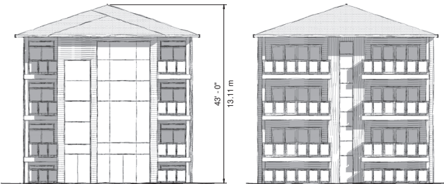
1 FRONT SOUTH ELEVATION 3/32" = 1'-0" 2 REAR NORTH ELEVATION 3/32" = 1'-0"