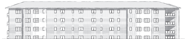
3 LEFT WEST ELEVATION 3/64" = 1'-0"