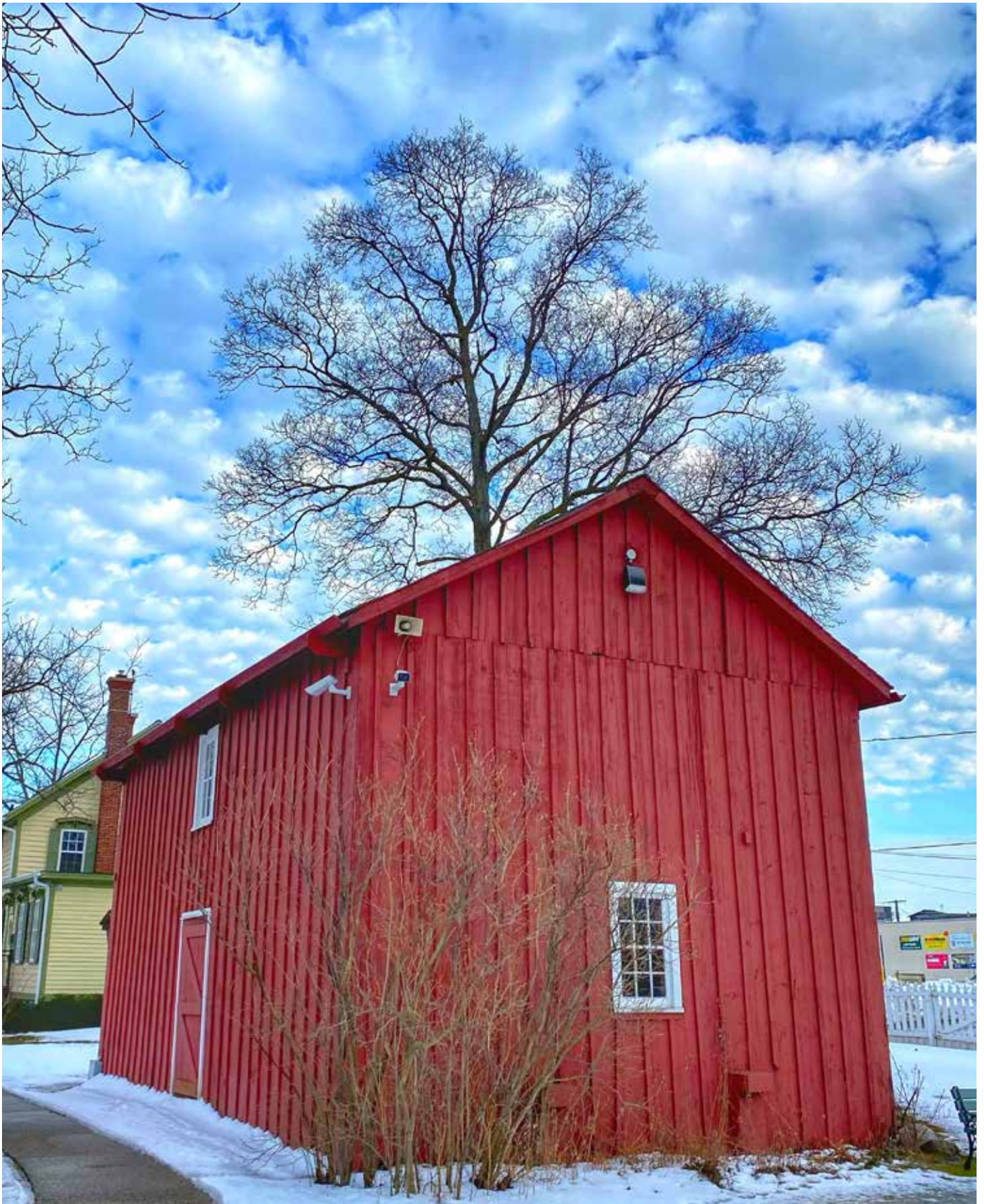
Our 1870 carriage house, original to the site, received new cedar shingles as part of our capital improvements.