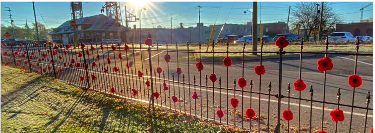
Above and right: Hand-knit poppies were installed on the museum's fencing to commemorate the 100th anniversary of the poppy as symbol of remembrance.