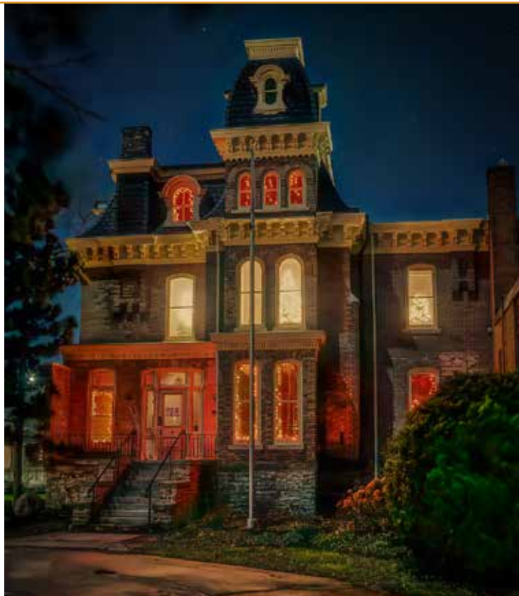
Roselawn Centre lit up for the holidays.