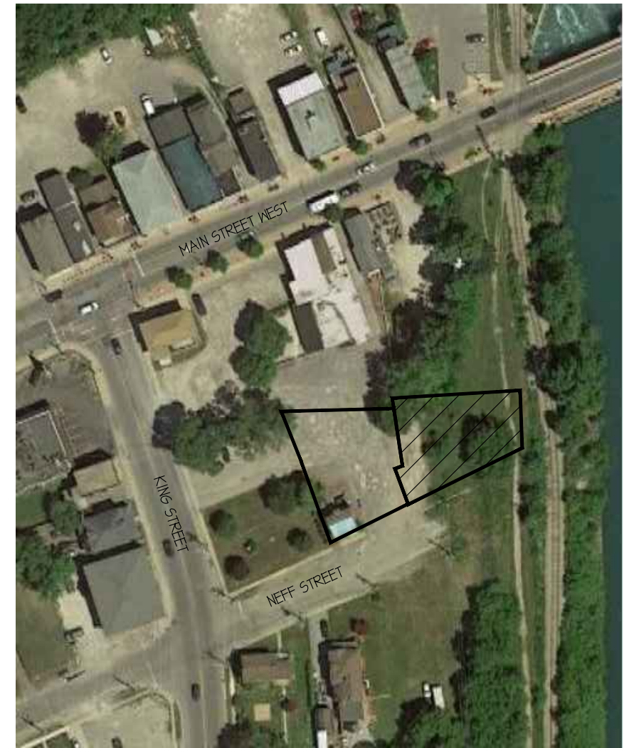
LOCATION PLAN SCALE: N.T.S.

THESE DRAWINGS ARE NOT TO BE SCALED ALL DRAWINGS, THE DESIGN, AND THE DETAILS THEREON REMAIN THE PROPERTY OF THE ARCHITECT AND ARE NOT TO BE ALTERED, RE-USED OR REPRODUCED WITHOUT THE ARCHITECT'S EXPRESS WRITTEN CONSENT. THE CONTRACTOR MUST FIELD VERIFY ALL DIMENSIONS AND MUST CONFIRM & CORRELATE ALL DETAILS WITHIN THE FULL DRAWING PACKAGE BEING RESPONSIBLE FOR SAME THROUGHOUT CONSTRUCTION, REPORTING ANY DISCREPANCIES TO THE ARCHITECT PRIOR TO COMMENCING THE RELEVANT WORK. ALL DRAWINGS, DETAILS & SPECIFICATIONS REPRESENTED IN THE DRAWINGS ARE TO BE USED FOR CONSTRUCTION ONLY WHEN ISSUED BY THE ARCHITECT AND NOTED ACCORDINGLY IN THE 'ISSUE/REVISIONS' BOX HEREON.