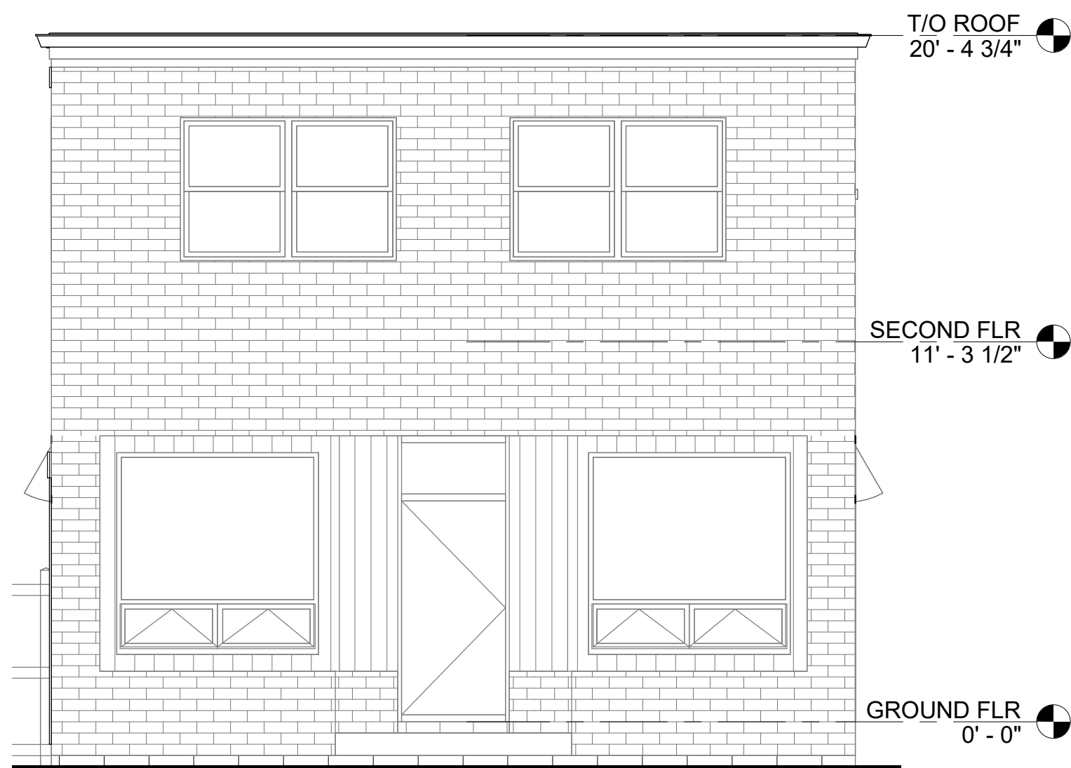
① .FRONT ELEVATION 1/4" = 1'-0"