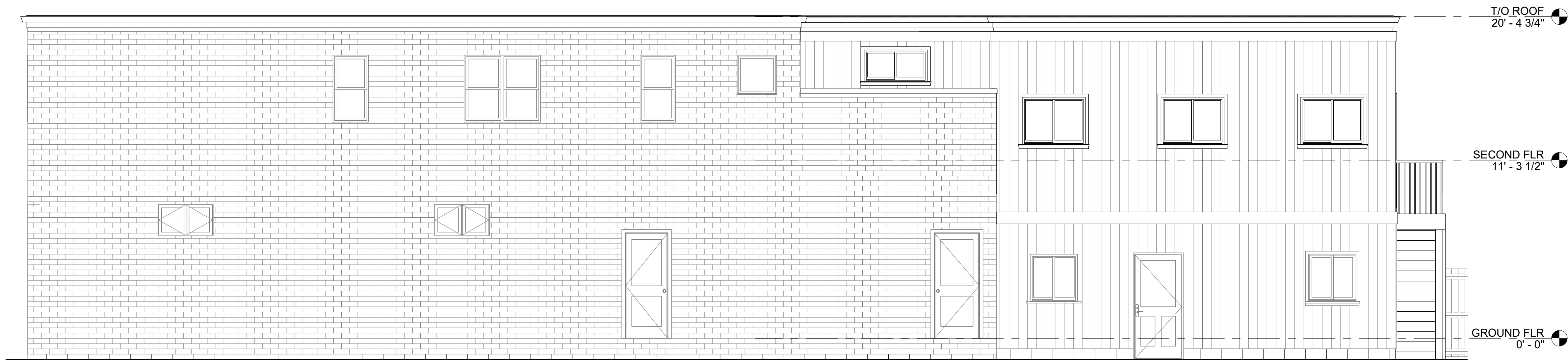
② .SIDE B ELEVATION 1/4" = 1'-0"