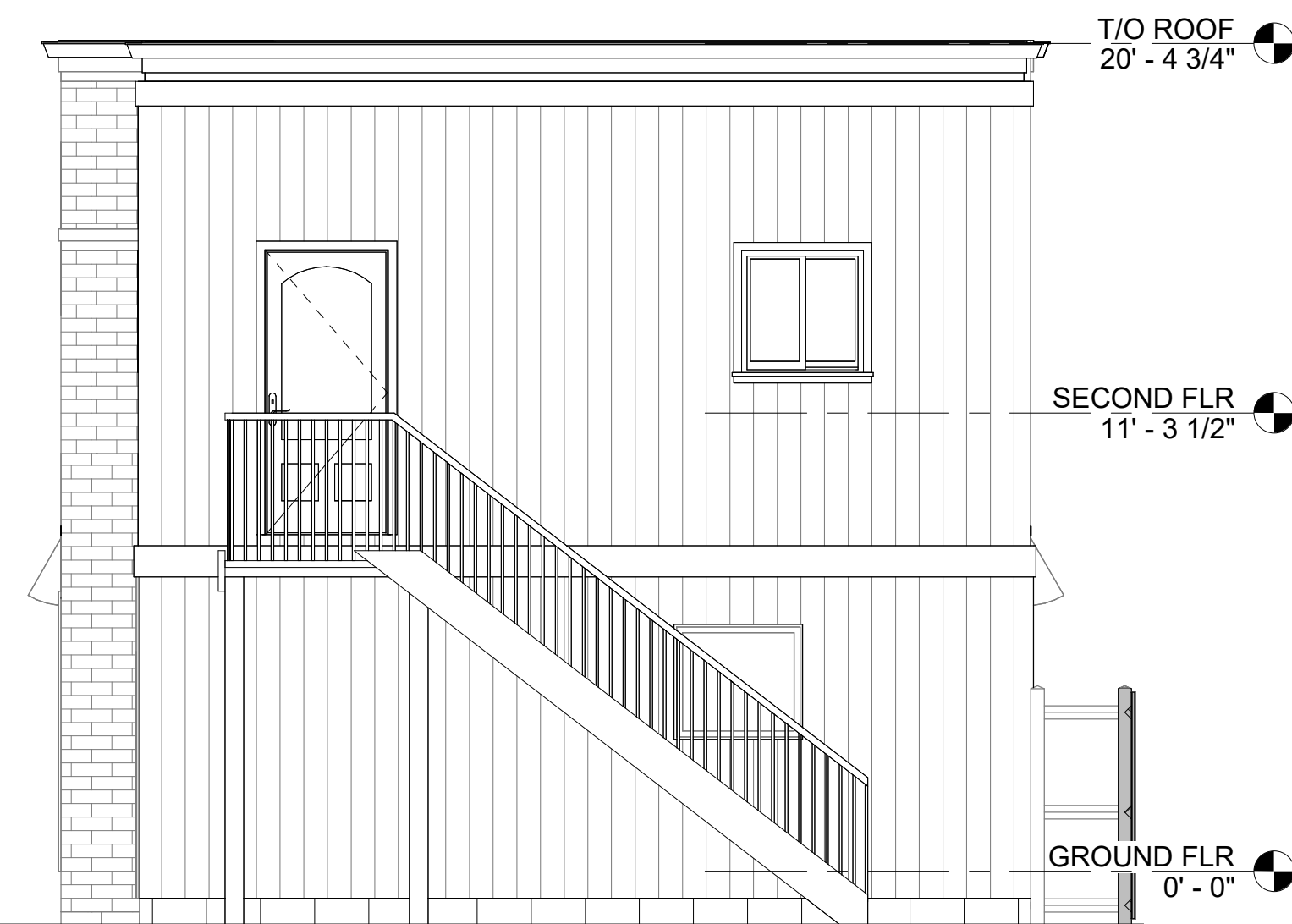
③ .REAR ELEVATION 1/4" = 1'-0"