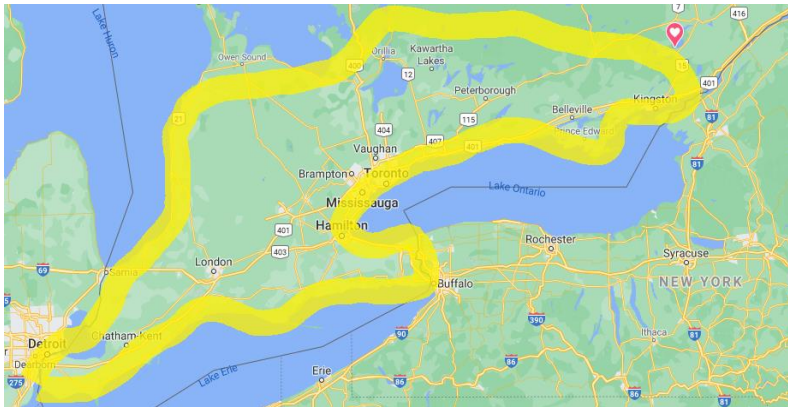
Marketing Target Area