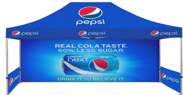
Example of Event Tents